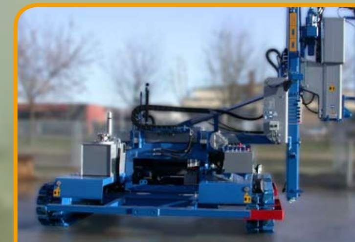
Hydraulically extendable crawler.

Manufacturer reserves the right to change the technical features above mentioned without prior notice. Pictures may show not standard accessories.