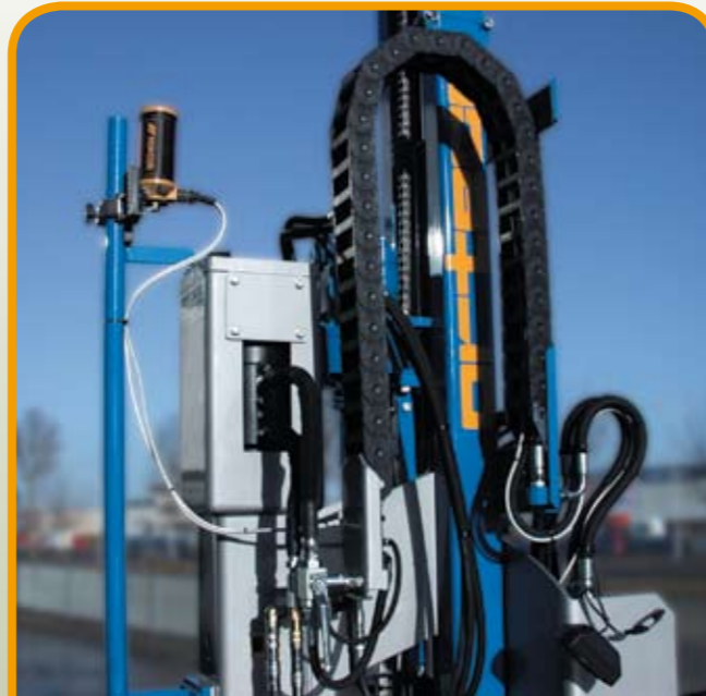
Active laser and auxiliary hydraulic circuit