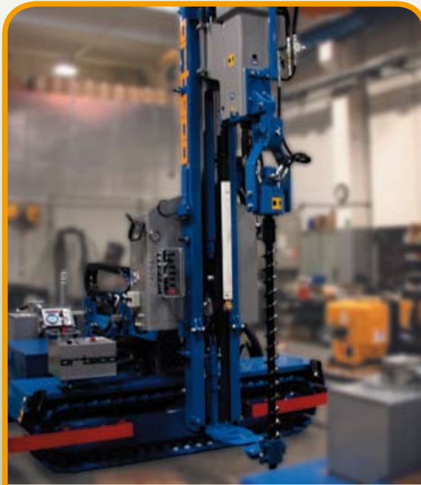
Piledriver with Hydraulic Auger