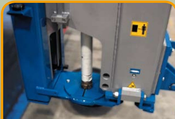
Down the hole hammer in stand-by position