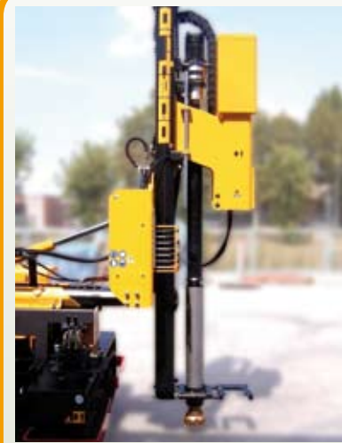
DOWN THE HOLE HAMMER